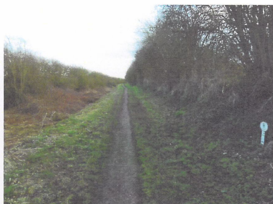
Example of unpaved track beside canal (by Nottingham Rd). Some weed control needed.

Cropwell Bishop Parish Council would be pleased to discuss this low cost proposal with the County Highways team.