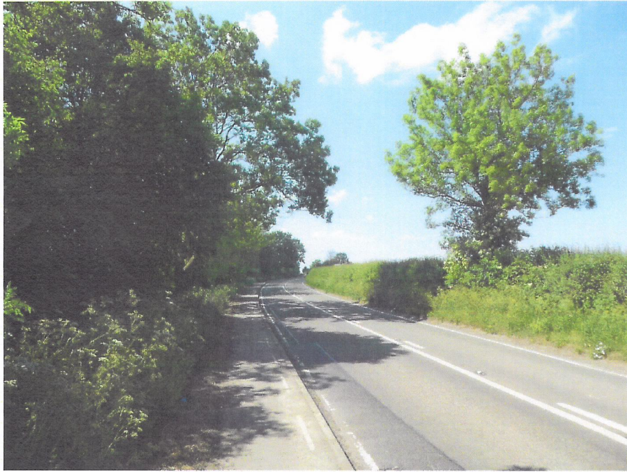
Fig 3A – Picture taken May 2020 of the section of footpath/cycleway constructed 2015