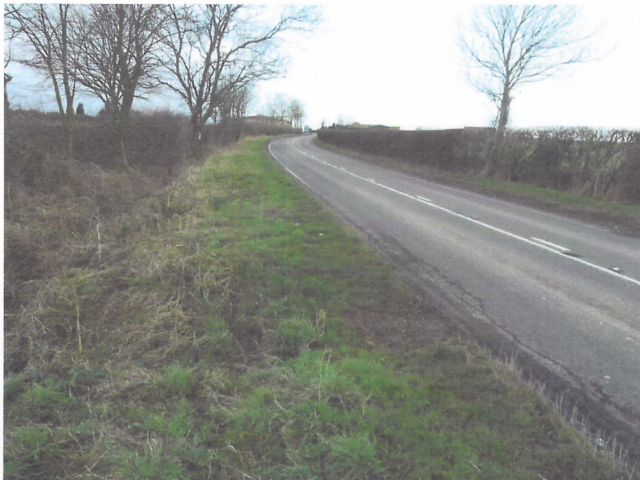
Figure 3 Section for initial construction of Track, Nottingham Road. View towards new creamery.

(See Fig 3A below showing same section after construction of the Footpath/cycleway in 2015)