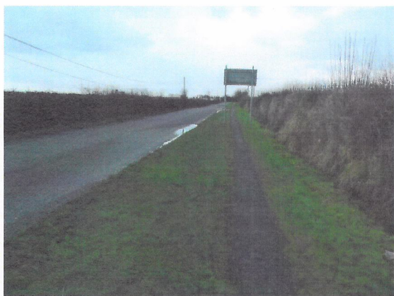
Example of a similar (but paved) track on Kinoulton Road. (only 0.75m wide)